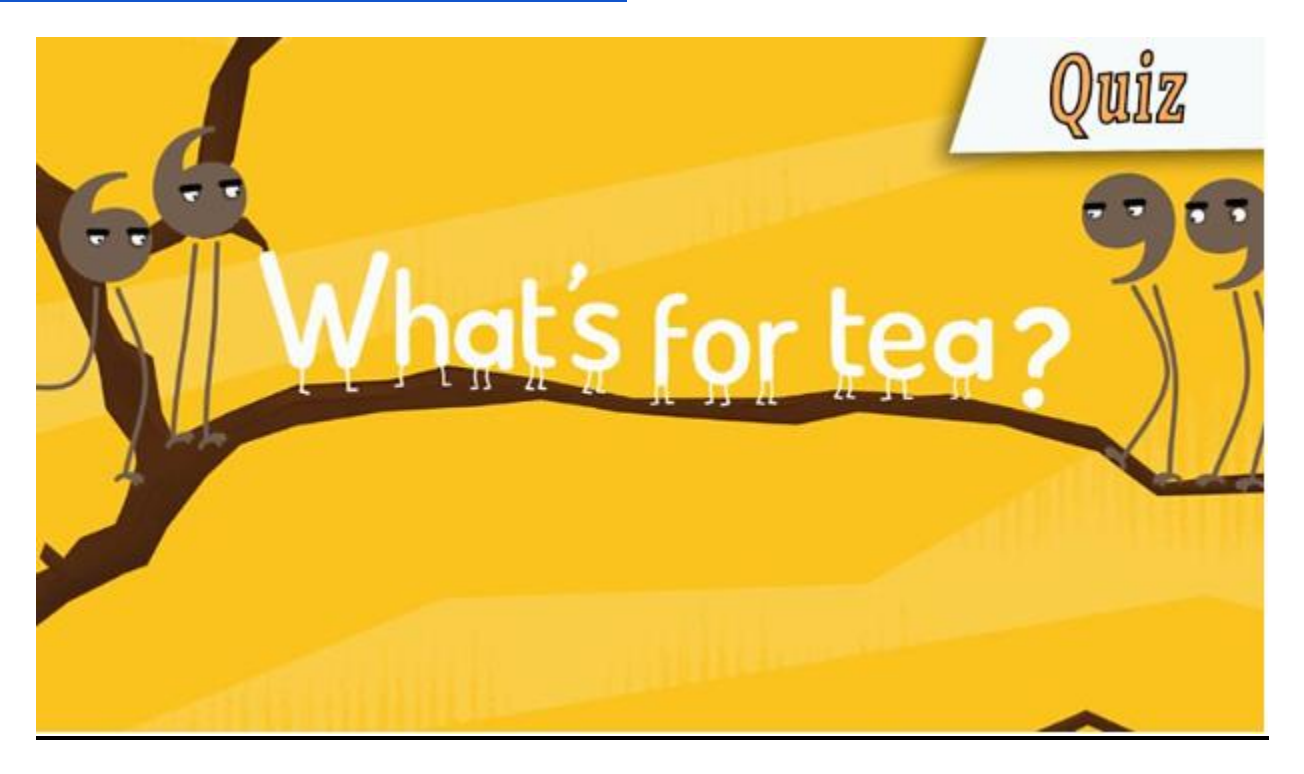
Have a go at the quiz!

https://www.bbc.co.uk/teach/supermovers/ks2-english-inverted-commas-with-mr-smith/z62rhbk - Watch the video to start