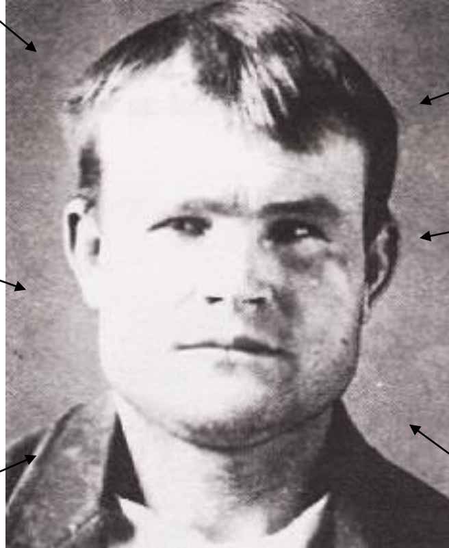
Robert LeRoy Parker

Escaped to Bolivia, where he was killed in a shoot- out.