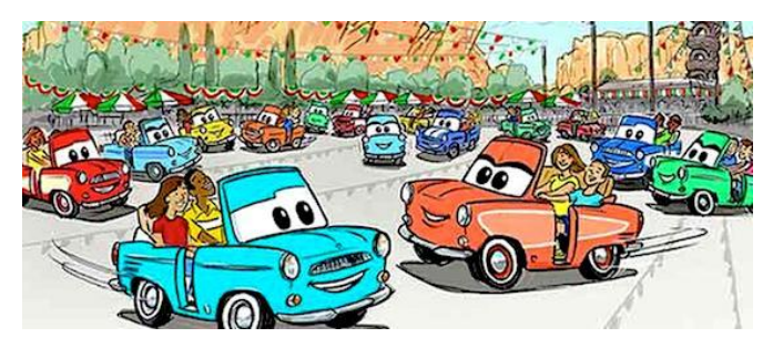
Luigi's Rollickin' Roadsters