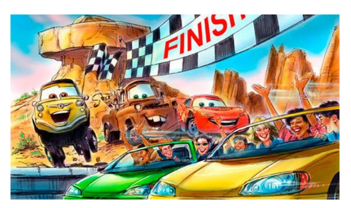
Radiator Springs Racers